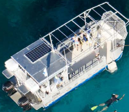
1770 LARC! TOURS, GLADSTONE

Pack your bags and explore some of the world's greatest wonders, all within a short drive from the Bundaberg Cup. Take a scenic flight across to Lady Elliot Island and dive into the kaleidoscope of colours of the Southern Great Barrier Reef. Be immersed in stories from ancient Indigenous cultures through Hervey Bay Marine Tours, or further north, witness the prolific wildlife on a guided day trip by 1770 Larc! Tours. Grab your keys and experience the road trip of a lifetime. We can't wait to show you around.